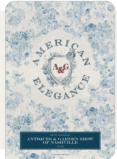
2026 Catalog Cover

Now the oldest and largest show of its kind in the U.S., Antiques & Garden Show of Nashville has become a national event. Last year, more than 17,000 attendees came to shop over 150 dealers and hear from renowned design, architect and landscape expert speakers.